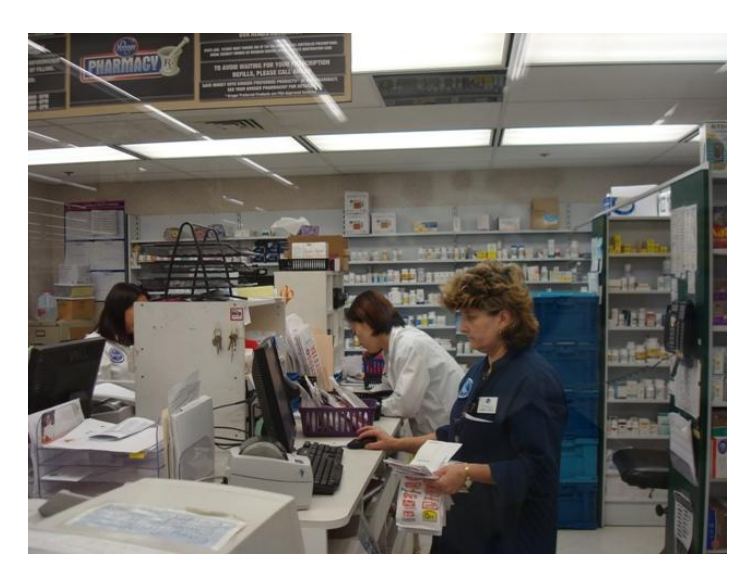
Photo 2: Pharm. D Students in USA Doing Clerkship in Community Pharmacy

place. The "business" show of Indian community pharmacies are often managed by the owners or their spouses and domestic aids in disguise.