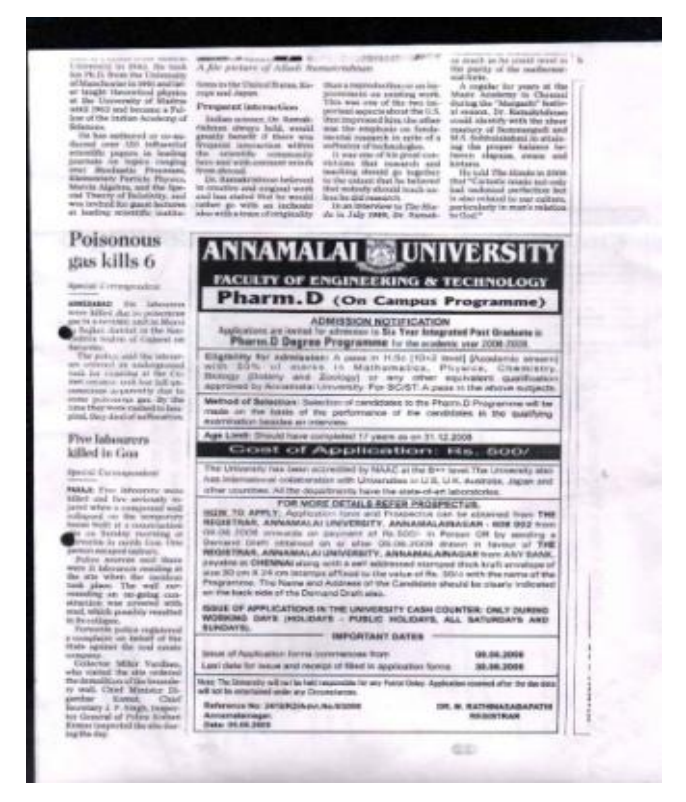
Figure 4: First Indian Advertisement Dated June 5, 2008 for Pharm. D Admissions

The norms and regulations for Pharm. D programwere also prescribed and notified netrestingly by the time the notification for Pharm. D came out, the University Grants Commission (UGC) has sanctioned Rs. 50 lakh to Annamalai University in Tamil Nadu for starting Pharm. D as an innovative program. By the time Govt. notification came for Pharm. D, Annamalai University got the grant from UGC for the program. Annamalai University is the first institution in India notified for Pharm. D admission in the first week of June 2008 (Figure 4).