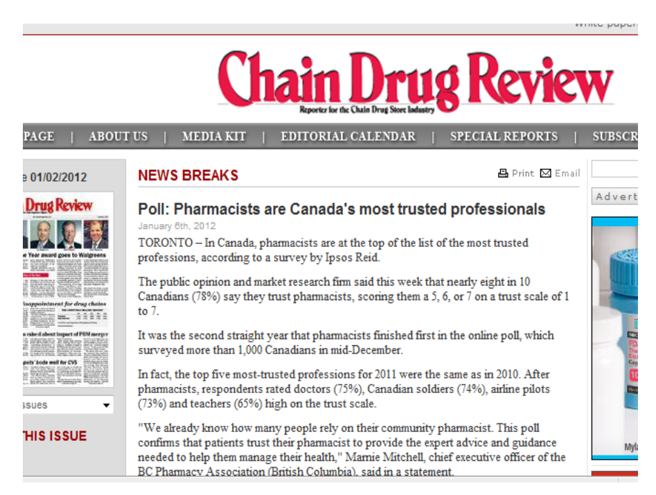
Figure 2: Canadian Poll 2011 - A Report